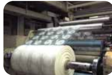
Flexible Packaging Materials